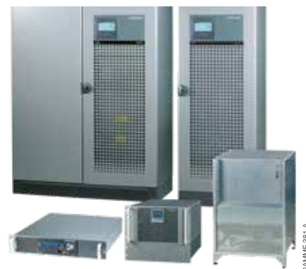
GAMME 391 A

Please contact us for any other requirement.