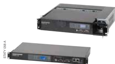
STATY 089 A